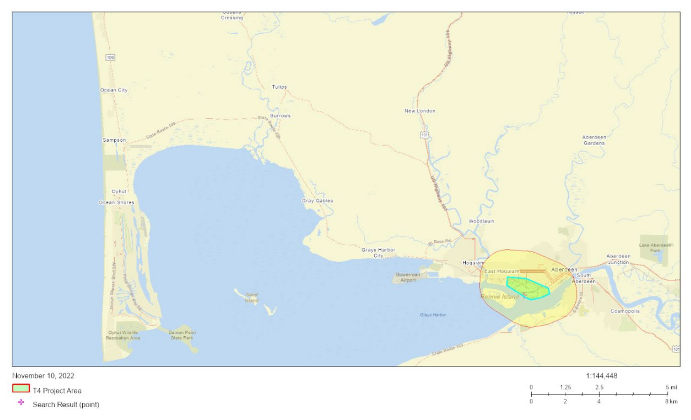
Map 3: EJSCREEN Buffer Area around T4 Project