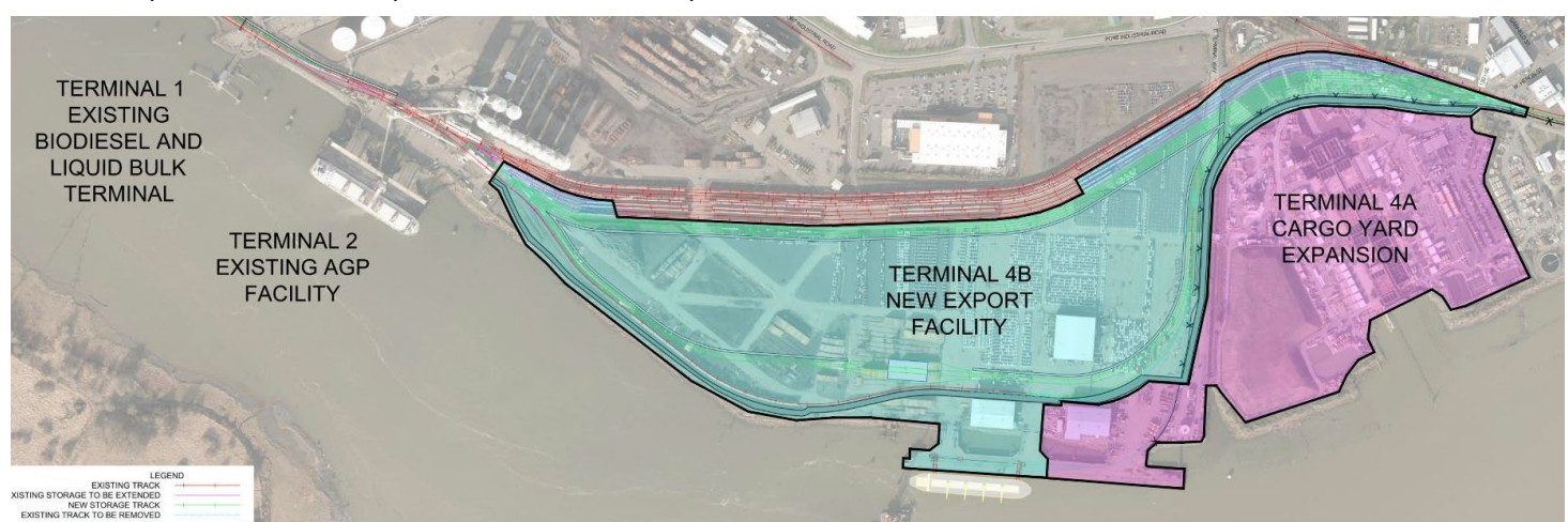
Map 1: Terminal 4 Expansion and Redevelopment Area

Each of these meetings will offer the public an opportunity to submit comments about any aspect of the Project or process.