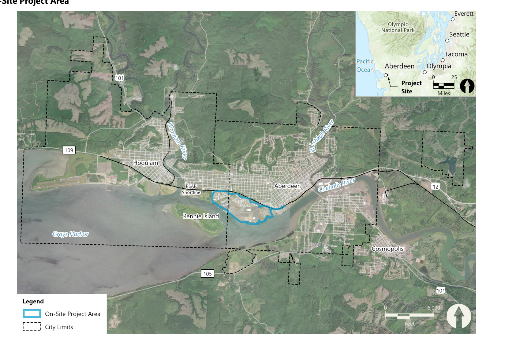
Figure 1 On-Site Project Area