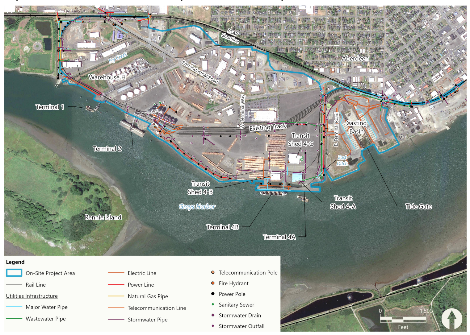
Figure 4 Major Utilities Infrastructure Within and Adjacent to the On-Site Project Area