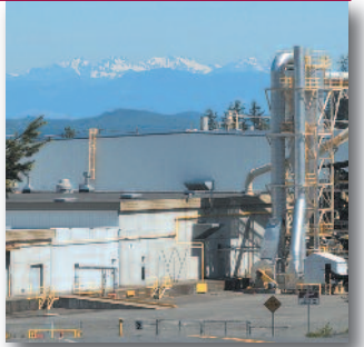
100 Technology Way Class A Office/Commercial 43,000 sq. ft.