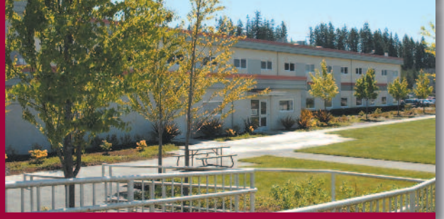
150 Technology Way, Class A Office/Commercial 48,000 sq. ft. Satsop Development Park offices