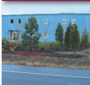
50 Enterprise Lane Office/Commercial 15,000 sq. ft.